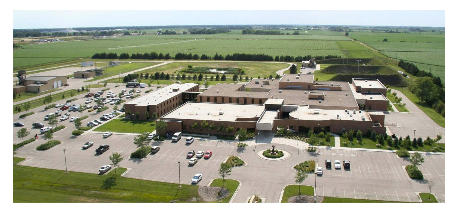
The Nebraska Law Enforcement Training Center (NLETC) Campus in Grand Island.

The center provides mandatory basic and specialized training for law enforcement and detention officers statewide, including continuing education and specialized training programs. Specialized training topics include law enforcement, drug enforcement, highway safety, emergency vehicle operation, firearms, violent crime and homicide investigations and Spanish for law enforcement. The facility has not been upgraded since 2000.