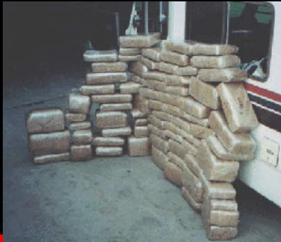
Over 1000 lbs. of marijuana seized by an officer who uses the techniques.